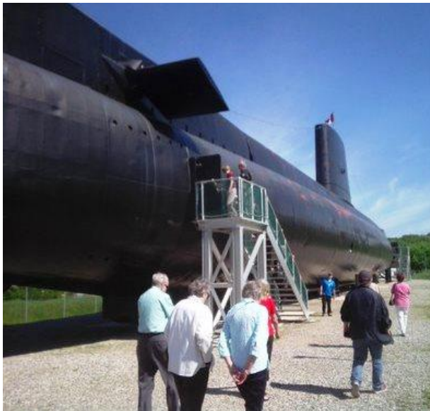
Exterior of HMCS Ojibwa, Port Burwell, Ontario.