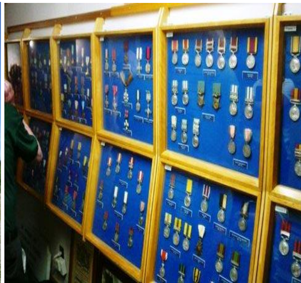
Medals donated to The Elgin Military Museum, St. Thomas, Ontario.